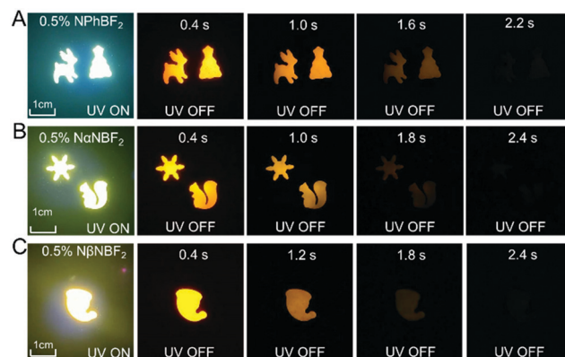
Fig. 2 Photographs of (A) NPhBF 2 –MeOBP-0.5%, (B) NαNBF 2 –MeOBP-0.5% and (C) NβNBF 2 –MeOBP-0.5% afterglow materials under 365 nm UV light and after removal of the UV light.