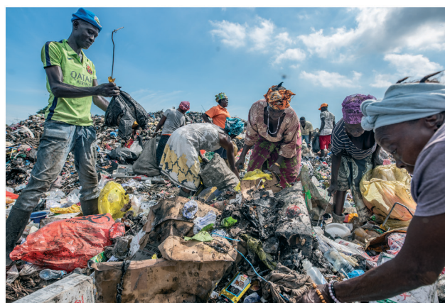
Fig. 2 Left: Operator moving waste after incineration in a public referral hospital, Sierra Leone. Right: People at public rubbish dump pick through the medical waste from a Community Health Post (CHC), Western Rural Area, Sierra Leone.

which are used in some low-resource settings, will not. In addition, when dumped in landfills (Fig. 2), plastics will persist for hundreds of years in the soil. The sustainability and safety of single-use POCTs could, to various degrees, be improved by technological solutions.