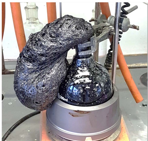
Fig. 4 Photograph of an inverse vulcanisation reaction after the effects of auto-acceleration. The reaction was carried out by heating 50 g of dicyclopentadiene and 50 g of sulfur at 140 °C in a 500 ml flask. Before the point where auto-acceleration occurred, the reaction mixture consisted of ~100 ml of smooth liquid being stirred and heated. After the heat generated by the exothermic reaction became too great to be lost to the surroundings, the mixture bubbled up rapidly – changing from a calm liquid to the form seen in approximately 2 seconds.

The most prominent and prohibitive obstacle that must be overcome when dealing with the scale-up of the inverse vulcanisation reaction is its inherent exothermicity and the ensuing auto-acceleration that can occur, also known as the Trommsdorff-Norrish effect. 93 This effect becomes relevant when exothermic polymerisation emits heat during its propagation phase, which increases the rate of initiation and thus also of propagation, hereby liberating yet more heat. This cycle of increasing heat liberation can cause a runaway reaction worsened by the fact that with more propagation, the molecular weight (and degree of cross-linking if applicable) increases, which increases the viscosity of the reaction and decreases the efficiency of stirring. With poor stirring comes less effective dumping of heat out of the reaction and into the surroundings, leading to heat build-up and temperature increases within the reaction mixture, accelerating propagation, which compounds the problem. Consequently, inverse vulcanisation reactions will often undergo an auto-acceleration event when they are removed from stirring or agitation and are allowed to settle.