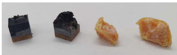
Fig. 9 Inverse vulcanised polymers showing visual evidence of the sulfur bloom effect. The polymers on the right show severe sulfur bloom all over the pieces due to being made with excessively high sulfur contents and not being cured. The polymers on the left show moderate sulfur bloom. Note how the sulfur bloom occurs toward the bottom of these polymer cubes because they were poured into a 1 cm 3 mould too early in their reaction, resulting in the denser sulfur sinking to the bottom of the cube in the absence of stirring. This led to excessively high sulfur concentrations in the bottom of the cube in comparison to the top, which could not be stabilised, resulting in sulfur bloom. Reproduced with permission from RSC Appl. Polym. , 2025, 3, 10–42. Under the Creative Commons Attribution 3.0 Unported Licence, Royal Society of Chemistry.

of this unreacted sulfur may lead to accelerated sulfur bloom and hydrogen sulfide evolution. Adjusting the reaction conditions allowed for control over the quantity of unreacted sulfur generated during the reaction. The quantification of this unreacted sulfur has been reported in multiple instances e.g. in lignin–sulfur polymer composite materials assessed for their mechanical properties. 185,186