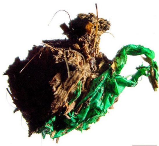
Fig. 3 Examples of microaggregates containing polymers. Scale bar = 2 mm.

Improving test strategies for the environmental hazards of polymers. Given the above considerations, more testing needs to be done to comprehensively understand the environmental hazards of weathering and degradation products of polymers, as well as the actual uptake and chronic toxicity of different polymer groups. This is particularly crucial for polymers with high production volume and/or wide dispersive potential (see Fig. 1 and Section 3.4).