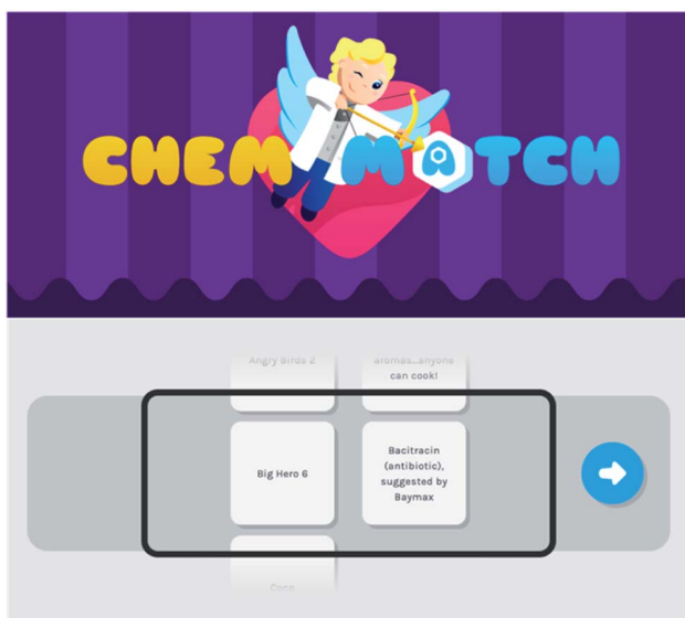
Fig. 6 ChemMatch, an online matching game that serves as an educational resource for children, students, and adults.

In addition to the books and online resources created by our lab, there have been a multitude of chemistry books and activities that connect children with the science found around them. 26 Introducing chemistry to children at a young age can have a lasting impact on the importance of science in their worldview. More broadly, developing resources that reach a wide audience can also help to promote a positive public perception of chemistry among non-scientist adults. We look forward to seeing future efforts in this area.