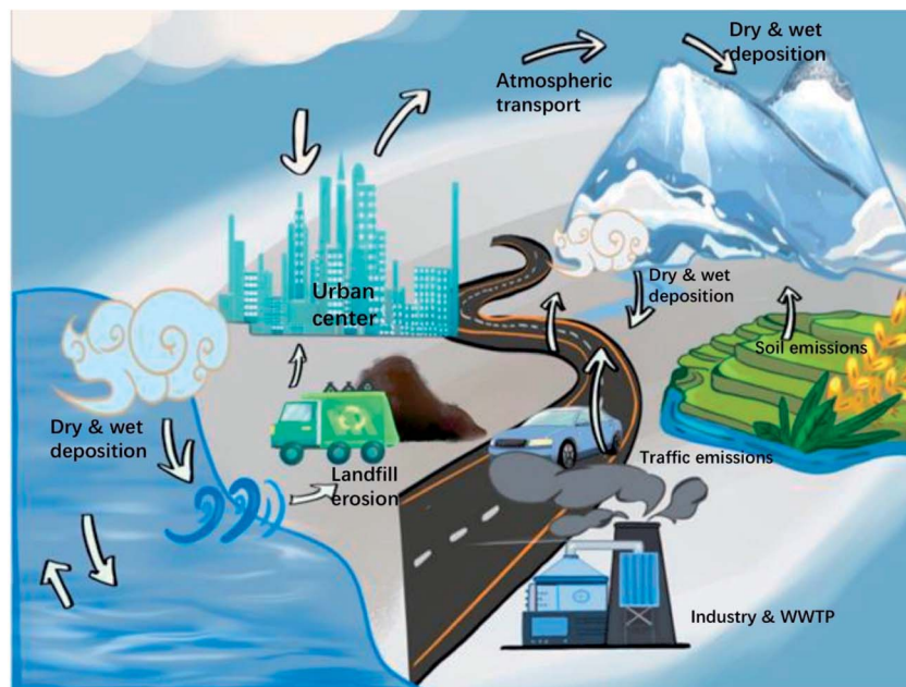
Fig. 4 Sources, transport and fates of MPs in the atmosphere.

smaller ones tend to be suspended in the atmosphere for a longer duration, transported to greater distances, or enter terrestrial or marine systems by wet deposition. This also explains the particle size <50\ \mu\text{m} observed in the remotely transported atmosphere. 86 In an experiment, 62 the proportion of microfibers in the TSP decreased the most, and it was speculated that microfibers were more likely to sink. Meanwhile, the amount of PE collected at night was four times higher than that during the day, speculating that this may be related to the density and water absorption of the polymer. Airborne MPs with lower densities are more likely to be transported farther. 89