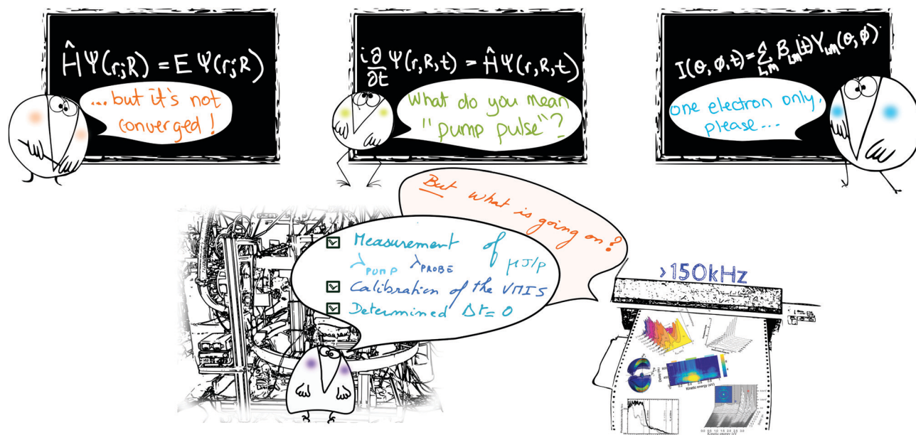
Fig. 2 A Shadoks' view of time-resolved photoelectron spectroscopy for new users: a joint analysis of experimental and theoretical data leads to a quantitative interpretation of the photodynamics.

of the full-dimensional surface is that it enables a level of convergence and quantitative accuracy that is often inaccessible to ab initio on-the-fly approaches.