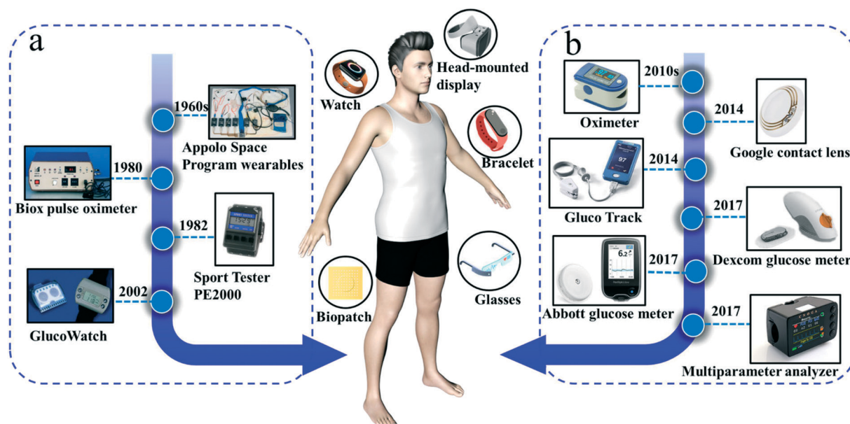
Fig. 1 The development of commercial translation for health monitoring wearable devices. (a) The past wearables for health monitoring. From the top: an initial prototype wearable equipment for astronauts in 1960s, an oximeter equipment worn on fingers in 1980, a watch-like wearable for heart rate monitoring in 1982, a wearable glucose meter based on iontophoresis in 2002. (b) The present advanced commercial wearable devices for patient-friendly diagnosis. From the top: a fingertip worn oximeter produced by Contec, Inc. (Hebei, China) in 2010s, Google contact lens for glucose biosensing and wirelessly transmitting signal in 2014, Gluco Track (Cnoga, Inc., Israel) as a finger clip for non-invasively monitoring glucose based on optical absorption and reflection in 2014, a G5 continuous monitoring wearable device (Dexcom, USA) for ISF glucose based on electrochemical platform in 2017, Abbott Freestyle Libre (Abbott, Inc.) for ISF glucose monitoring during 14 days by entrapping glucose oxidase on a soft conductive bio-needle in 2017, a fingertip analyzer produced by Cnoga, Inc. for multiplexed analysis based on optical absorption and reflection in 2017.

Commercial wearable products on the market, such as wearable blood glucose meters, undergo a long period of evolution before they can be meaningfully promoted. The predecessor of wearable blood glucose meters is a biosensor for glucose detection developed by Leland Clark and Ann Lyons of Cincinnati Children's Hospital in 1962. After a long period of research on non-invasive wearables, Cygnus launched the GlucoWatch product in 2002.