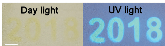
Fig. 5 Photographic images of 2 in PEO. The letters were generated upon irradiation at 365 \text{ nm} . The scale bar is 2 \text{ mm} .

Hg(II) is one of the most toxic metal ions for human health, and is widespread in environmental samples. 10 The detection of Hg(II) has long been a great concern. According to the reports,