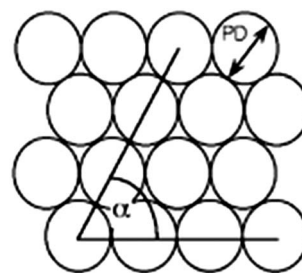
Fig. 8 The ideal hexagonal arrangement in the pores of a honeycomb structured porous film where alpha is the angle among three adjacent pores and PD is the pore diameter. Reprinted from S. D. Angus and T. P. Davis, Polymer surface design and infomatics: facile microscopy/image analysis techniques for self-organizing microporous polymer film characterization , Langmuir , 2002, 18 , 9547–9553.

Likewise, frequency distribution plots 2D and 3D (Fig. 9) contour plots of the first order near-neighbouring X–Y centers are obtained.