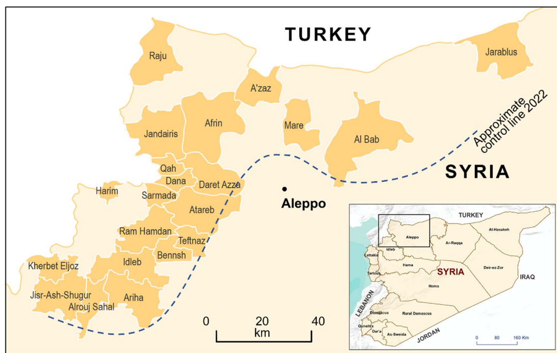
Fig. 1 Regional map showing 21 sub-districts sampled in this survey and their locations in the opposition-controlled region of North-West Syria. The dashed line indicates schematically the contested limit of Syrian Government control at the time of this study, shown for illustration only.

Several studies assessing potentially toxic element contamination in Syrian soils pre-dating the recent conflict exist (Table 1), although none of these present a broad regional survey. Möller et al. 18 assessed the extent and severity of heavy metal contamination of arable soils in the Damascus Ghouta whilst Husein et al. 19 measured the spatial distributions of Cu, Cd, Pb, Zn in the soil of the industrial Orontes floodplain around Hama, although the date of sampling is not stated. The concentrations of potentially toxic elements in cultivated soils