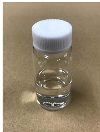
Fig. 40 Bio-ethanol made from bamboo waste as non-edible biomass. 178

My group also prepared 100% biomass biodegradable plastics from waste wood, bamboo, paper, newspaper, food, waste tofu, waste shochu (Japanese alcohol liquor), etc. In addition, we created plastics made from waste Sargassum , which is seaweed in the Caribbean Sea. Recently, the quantity of Sargassum there has been increasing because of global warming and the rich nutritious soil flowing into the ocean due to Amazon deforestation. In various places, including Antigua and Barbuda near the Caribbean, the state of Florida in the USA, Mexico, and some parts of South America, there are severe problems of decomposing Sargassum reaching the beaches, causing a foul smell. Thus, 100% natural biomass-based biodegradable resin pellets made from Sargassum waste were