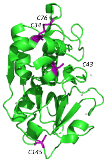
Fig. 4 Ribbon structure of silicatein (6ZQ3) 30 with cysteine residues highlighted in purple. Figure made with Pymol.

previously shown in native conditions. This suggests that in a native state, free cysteines C43 and C145 likely facilitate intermolecular disulfide bridges with multiple msGFP2-silicatein molecules. Nonetheless, reduced msGFP2-silicatein still appears to be dimerizing (monomer MW 48 kDa), implying that other intermolecular forces contribute to silicatein aggregation behavior. This result also indicates that fusion partner may have a limited impact on oligomerization and in some instances is able to reduce silicatein aggregation.