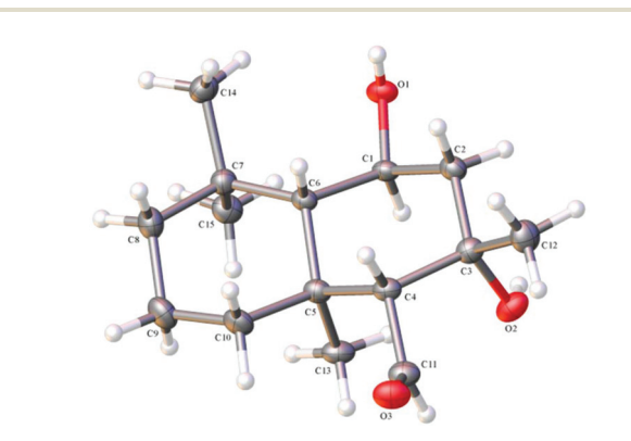
Fig. 1 ORTEP image of aldehyde 21

The synthesis of a (Z)-haloalkene fragment such as 13 began with aromatic nitration of commercially purchased 4-methylacetophenone using HNO<sub>3</sub>/H<sub>2</sub>SO<sub>4</sub> to nitro compound 23 and hydrogenolysis of the nitro group to an aniline intermediate, before diazotisation and in situ hydrolysis finally gave phenol 24.11 O-Protection of 24 as the tert-butyldimethlsilyl ether using TBSCl in the presence of imidazole gave the siloxyacetophenone 25 (Scheme 4). There are scarcely any methods for the halo-olefination of acetophenones. Indeed, the use of standard halogenated Wittig and Horner-Wadsworth-Emmons reagents in combination with a range of bases was initially investigated but this resulted in either the return of starting materials or the observed formation of only traces of suspected alkenes. Of the few known methods for such a transformation we investigated a three-step process firstly reported by Barluenga<sup>12</sup> and later modified by Ando.<sup>13</sup> Treatment of acetophenone 25 with dibromomethyl lithium, formed through deprotonation of CH2Br2 with LiNi-Pr2, facilitated conversion to alcohol 26. The tertiary alcohol of 26 was then protected as the trimethylsilyl ether using TMSCl in the presence