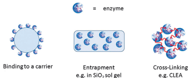
Fig. 1 Different methods for immobilising enzymes.

(i) Binding to a support (carrier) can be physical (such as hydrophobic and van der Waals interactions), ionic, or covalent in nature. 11 However, physical binding is generally too weak to keep the enzyme fixed to the carrier under rigorous industrial conditions of high reactant and product concentrations and high ionic strength. Ionic binding is generally stronger and covalent binding of the enzyme to the support would generally prevent the enzyme from leaching from the surface. On the other hand, covalent bonding to the enzyme has the disadvantage that if the enzyme is irreversibly deactivated, both the enzyme and the (often costly) support are rendered unusable. Typical supports for enzyme immobilisation are synthetic