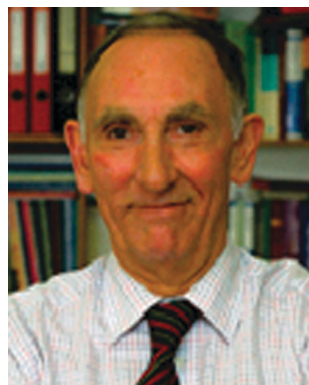
Roger A. Sheldon

(iii) Cross-linking of enzyme aggregates or crystals, employing a bifunctional reagent, is used to prepare carrierless macroparticles. The use of a carrier inevitably leads to ‘dilution of activity’, owing to the introduction of a large portion of non-catalytic ballast, ranging from 90% to >99%, which results in lower space-time yields and productivities. This is not alleviated