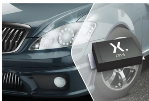
Fig. 22 Si-Ge rectifiers in automobile sector.

b. Automotive industry. Si-Ge rectifiers coalesce the efficacy of Schottky rectifiers having thermal constancy of fast recovery diodes, empowering scientists and engineers to augment their power outlines of 100–200 V for enhanced efficiency, as shown in Fig. 22. The devices target applications in automotive sector, communications infrastructure, and server markets. By proposing