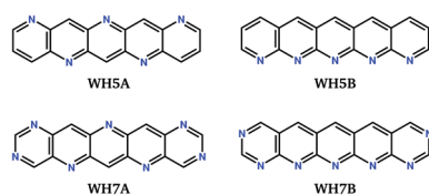
Fig. 7 Chemical diagrams of four azapentacenes proposed by Winkler and Houk. 15

Ten runs of the evolutionary algorithm were performed to minimise fitness function F_B , with all other details of the search identical to those using F_A . F_B includes a linear penalty equal to the Schottky–Mott model of the barrier for electron injection, which is applied to molecules with solid state electron affinities below 4.1 eV. The impact on the search is to restrict most sampling to molecules in the high electron affinity region of chemical space (Fig. 6a). In this region, all low-reorganisation energy molecules are linear (Fig. 6c) with 6 or 7 nitrogens (Fig. 6b), differing in the pattern of nitrogen substitution.