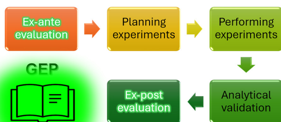
Fig. 2 Subsequent stages of the process of developing a new analytical method, indicating the moments when prospective ( ex-ante ) and retrospective ( ex-post ) evaluations should be carried out according to the GEP rules.

Moreover, it is worth mentioning again the benefits that the use of AI, especially LLMs, can bring in the future. It is easy to imagine the use of a specially developed Chatbot that would have extensive and constantly updated knowledge in the field of analytical chemistry journals, which would be trained to perform ex-ante analysis of the analytical procedures we plan to develop. It is worth mentioning that even now, the use of AI for the purpose of collecting and processing data and knowledge contained in articles is fully possible and, notably, does not violate general ethical principles. Indeed, how can we