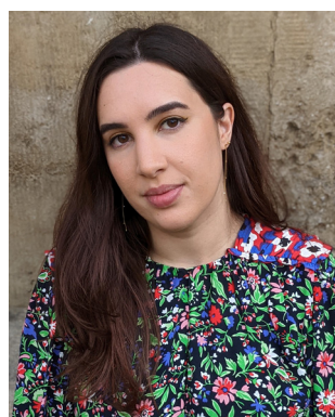
Alexandra J. Ramadan

Me-4PACz solution (1 mmol, ethanol) was statically spin-coated (60 \mu\text{L} and 100 \mu\text{L} for small- and large-area substrates, respectively) onto the substrate for 30 s at 3000 rpm in an \text{N}_2 filled glovebox before annealing on a hotplate at 100^\circ\text{C} for 10 minutes. No subsequent rinsing steps were applied. The \text{Al}_2\text{O}_3 nanoparticle solution ( \sim 0.1 \text{ wt}\% , isopropanol) was made by diluting a stock 20 wt% \text{Al}_2\text{O}_3 nanoparticle solution in isopropanol in a ratio of either 1 stock:200 neat IPA, 1 stock:100 neat IPA or 1 stock:50 neat IPA. The diluted solution was