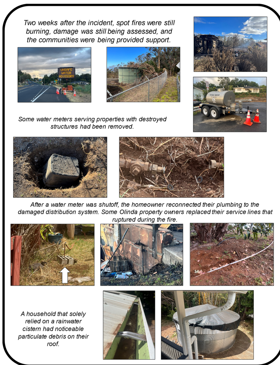
Fig. 2 Two weeks after the wildfire and the evacuation orders had been lifted, some fires were still burning, and various damage and household responses were observed.

The following results reflect our study's bias toward households affected by the Kula Fire: a majority of households that evacuated (7 of 11) either returned to their