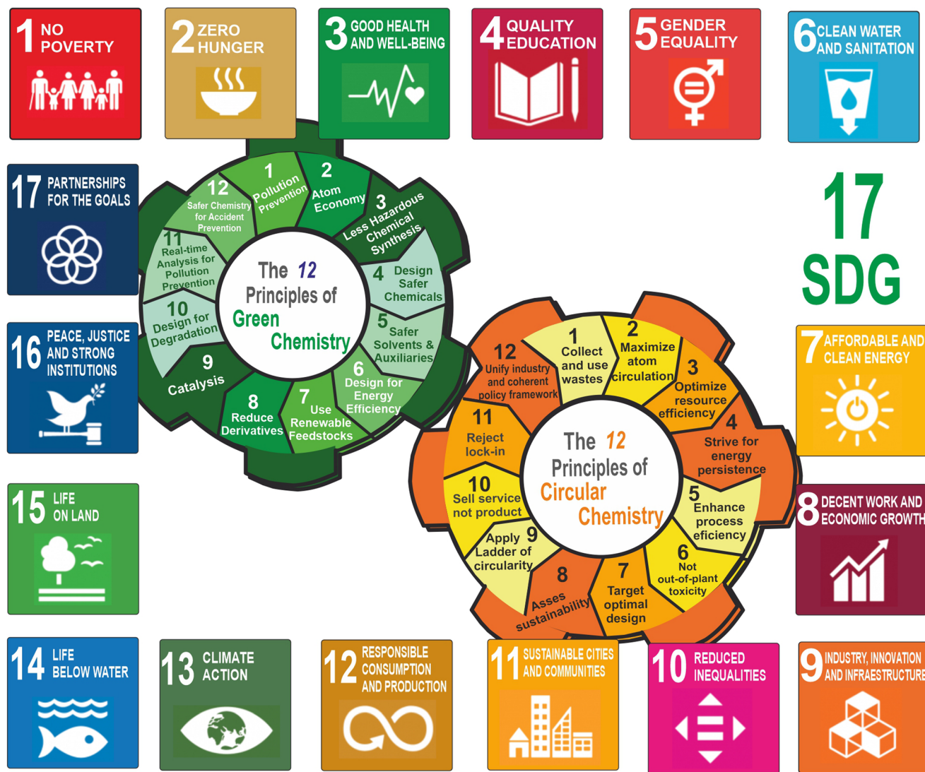
Fig. 1 Synergistic coupling between the two “sustainability engines”, represented by the Twelve Principles of Green Chemistry, 5 and the Twelve Principles of Circular Chemistry, 6 respectively, to achieve the 17 Sustainable Development Goals (SDGs), 4 launched by United Nations (UN) in 2015.