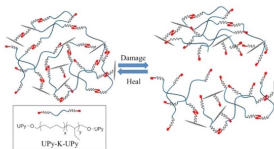
Fig. 6 Schematic of formation of supramolecular nanocomposites based on UPy-K-UPy and Upy-decorated CNCs. This figure has been adapted from ref. 41 with permission from American Chemical Society, copyright 2013.

To achieve high self-healing efficiency, researchers often incorporate hydrogen bond into the molecular structural design of self-healing material. 39 Han et al. 40 prepared various acrylic monomers with imidazole group and subjected them to UV irradiation to synthesize polymers with high conductivity. The hydrogen bond between the imidazole ring and hydroxyl group in the polymer endowed the material produced using the polymer with self-healing property, and the introduction of imidazole ring increased the glass transition temperature of the polymer. Biyani et al. 41 developed self-healing nanocomposites based on a telechelic poly(ethylene-co-butene), which was functionalized using tetrahydrogen bonded urea pyrimidine ketone (Upy) and cellulose nanocrystal, shown in Fig. 6.