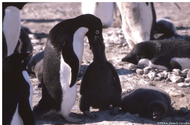
Fig. 2 An Adèle penguin feeding its chick.

Soil and pond sediment samples have been included in several studies on the POP contamination of the Antarctic regions (e.g. 6,50–52 ), although an analysis of a temporal trend in association with climate change still lacks in the literature for these environments. Only an article reports the correlations between climate parameters and contamination in a terrestrial ecosystem of Livingston Island (West Antarctica). 27 The authors suggested that the remobilization of PCBs is driven by changes in temperature and soil content of organic matter; they suggested that the current and future POP remobilization and sinks