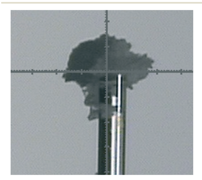
Fig. 1 A very small amount of powder ( ca. 0.01 mg) mounted on the top of a glass fibre in the single crystal X-ray diffractometer. Each major tick represents 0.1 mm.

Of the 15 materials studied, 14 (Table 1) were solved to a high degree of accuracy using DASH. Only \gamma -carbamazepine