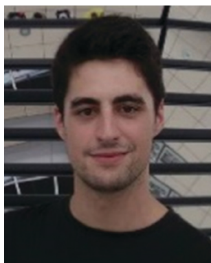
João C. Barbosa

The separator plays a key role in the battery, as it works as a physical barrier between the electrodes, avoiding the occurrence of short circuits during the operation. A good separator must possess thermal, mechanical and thermal stability 12 and must show high electronic resistance and high ionic conductivity to the Li + flow. 13 The most widely used materials for separators are polymers, such as poly(ethylene) (PE), poly(propylene) (PP) or poly(vinylidene fluoride) (PVDF). These polymers meet the requirement of high electronic resistance but lack the necessary high ionic conductivity.