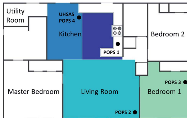
Fig. 1 Floor plan of the UTest house. Black dots and labels indicate instrument sampling positions. Colors for the different zones on this plot indicate how the data in this paper will be organized, with the darkest color being the measurement closest to the source (kitchen) and the lightest color being the furthest from the sources (bedroom 1). The kitchen is considered a single zone in this analysis but has two colors to represent the two different instruments and sampling points within the zone.

The HOMEChem campaign took place from 1 to 30 June 2018. 31 HOMEChem included a comprehensive suite of chemical and physical measurements that monitored both particle and gas-phase species during cooking, cleaning, and occupancy activities. The campaign utilized the UTest house at the University of Texas at Austin (Austin, TX, USA); a 3-bedroom, 2-bath house with a total house volume of 250 m 3 and a total floor area of 111