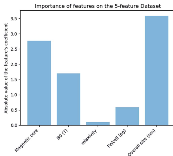
Fig. 3 Bar chart of the feature importance in the full nanoQSAR model.