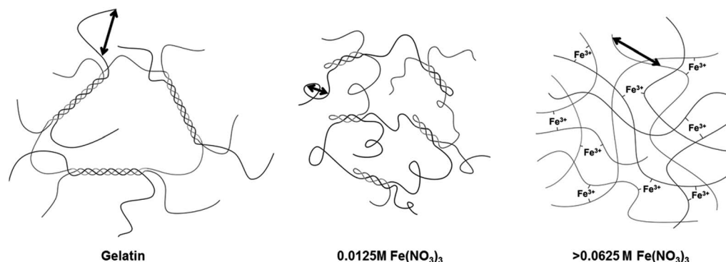
Fig. 6 Schematic showing the proposed structure of the gel at various Fe : gelatin ratios with arrows indicating the correlation length initially decreasing and then increasing as the polymer contracts and then swells.

To study the structure of gelatin in the presence of Mg and Fe nitrates, SANS was performed on samples of gelatin with iron and magnesium nitrates at molar ratios of 0 : 100, 1 : 99, 2 : 98 and 50 : 50. Fig. 7a shows SANS data for samples of gelatin with small amounts of iron nitrate (0.0025 mol L -1 and 0.005 mol L -1 ) both with and without magnesium nitrate (equivalent to 1 : 99 and 2 : 98 molar ratios respectively). In addition, a sample was prepared with 0.25 mol L -1 \text{Mg}(\text{NO}_3)_2 . The scattering profiles are shown in a constrained Q range for clarity as all of the data is the same above Q = 0.1 \text{ Å}^{-1} . The first point to note is that magnesium nitrate alone appears to have very little effect on the gel structure, as the scattering of the sample with 0.25 mol L -1 \text{Mg}(\text{NO}_3)_2 shows only a small area of slightly increased scattering intensity compared to a gelatin control. This is consistent with visual observations of samples of gelatin with magnesium nitrate which show no change in viscosity or appearance. The second