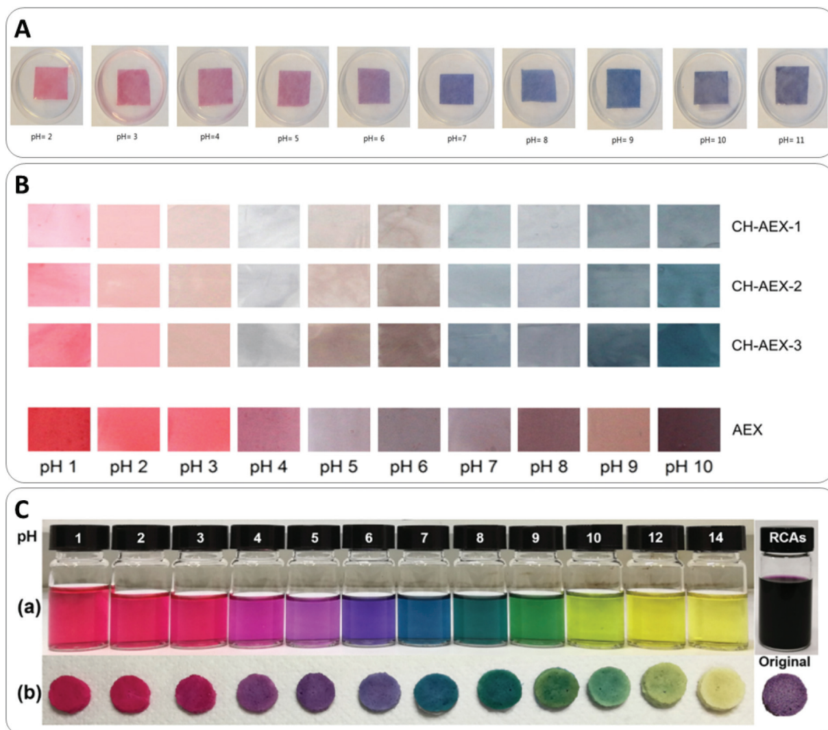
Fig. 4 Natural pH indicators. (A) Color changes for starch-paper films with carrot anthocyanins at different pH values (pH 2–11). Reprinted from M. M. Goodarzi, M. Moradi, H. Tajik, M. Forough, P. Ezati and B. Kuswandi, Development of an easy-to-use colorimetric pH label with starch and carrot anthocyanins for milk shelf life assessment, Int. J. Biol. Macromol. , 153, 240–247, Copyright (2020), with permission from Elsevier. (B) Color changes for chitosan films with different contents of black chokeberry pomace extract (AEX) immobilized in chitosan for colorimetric pH indicator film application, Food Packag. Shelf Life , 16, 185–193, Copyright (2018), with permission from Elsevier. (C) (a) Red cabbage anthocyanins (RCAs) solution response upon pH changes. (b) The PVA-PVP foam with MCC (thickness: 3.0 mm ± 0.2 mm, diameter: 14 mm) after dipping in solutions of different pH (in each case 10 ml for 3 min). Reprinted from J. Zia, G. Mancini, M. Bustreo, A. Zych, R. Donno, A. Athanassiou and D. Fragouli, Porous pH natural indicators for acidic and basic vapor sensing, Chem. Eng. J. , 403, 126373, Copyright (2021), with permission from Elsevier.

etables should be focused on slowing down the respiration rate and thus, retarding their ripening. 141 Additionally, edible coatings should be tasteless and should not modify the sensory characteristics of the food. 1,75 Advances made in the valorization of vegetable and fruit wastes to fulfill these requirements and a review of the latest publications in this field are summarized in Table 2 and included in the following subsections.