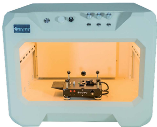
Fig. 3 Indoor PV testing setup as presented by, and reprinted with permission from Enlitech, ref. 36.

As with classic solar simulators, the first key parameter to control during indoor measurements is light uniformity. Unlike solar simulators however, where the certified uniformity is most often a small area up to 5 \times 5 \text{ cm}^2 , in indoor measurements there is a need for larger areas, as many research groups are starting to work on large area cells and mini-modules (Fig. 3).