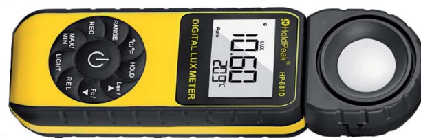
Fig. 4 Example of a common commercial lux meter.