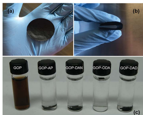
Fig. 2 GOP samples obtained (a) which can be folded without breaking (b). (c) Dispersibility test for pristine and amine-functionalized GOP samples in water after 10 min sonication. After three months, the functionalized samples remained without visible changes.

its surface. The paper can be folded and rolled without breaking or fracturing, suggesting that the individual GO sheets within the paper form uninterrupted networks, which provides the paper material high structural and mechanical stability. The mat thickness as determined by SEM can vary in the range of 16–30 \mu\text{m} (see below).