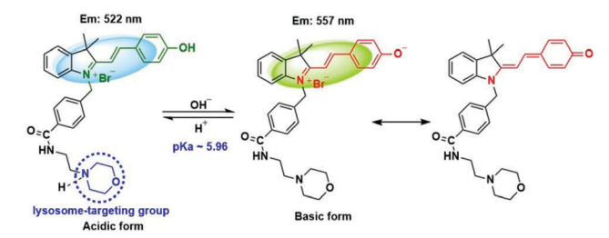
Fig. 2 pH switching of CPY for the ratiometric monitoring of lysosomal pH changes

Then, the stability of the fluorescence performance of CPY was evaluated towards different aqueous solutions with pH values of 4.5, 7.4, and 10.5, respectively (Fig. S1b, ESI<sup>†</sup>). No change of the fluorescence ratio F_{522}/F_{557} was observed, even when the time increased to 110 min, indicating a stable pH sensing process with CPY. To explore if other biological reagents could interfere with the pH sensing of CPY, some commonly available biological species were evaluated as interferences (Fig. S1, ESI†). The ions and bioactive molecules had imperceptible influence on the fluorescence of CPY in both weak acid (pH = 4.5) and neutral (pH = 7.2) environments (Fig. S1c and d, ESI†). Finally, the influence of different temperatures (from 37 °C to 45 °C) on the fluorescence of CPY was also investigated. The fluorescence ratio F_{522}/F_{557} of CPY solutions at pH values of 4.0, 6.0 and 9.0, respectively, remained stable when the temperature increased from 37 °C to 45 °C. All these results demonstrated the stable fluorescence performance of CPY in ratiometric sensing of pH changes (Fig. S6, ESI†).