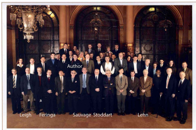
Fig. 4 Participants of the 21 st Solvay Conference on Chemistry "From Noncovalent Assemblies to Molecular Machines", Brussels, Hotel Métropole, 30 November 2007.