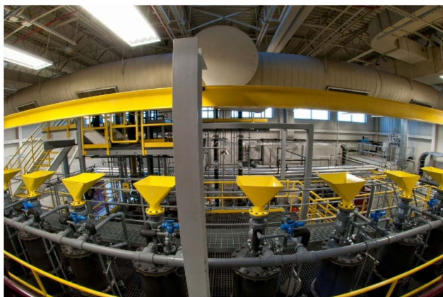
Fig. 18 Top side of the hydrolysis reactors at the Virdia pilot plant in Danville, the yellow conical funnels feed the wood material into the digesters.

utilizing a broad range of lignocellulosic materials, including municipal solid waste, agricultural residues, and forestry by-products. Processes like the Biosulfuroil biorefinery and Virdia's CASE technology demonstrated the potential of adapting saccharification methods to accommodate heterogeneous feedstocks. This adaptability ensures resilience in regions with varying biomass availability and opens opportunities for waste valorization.