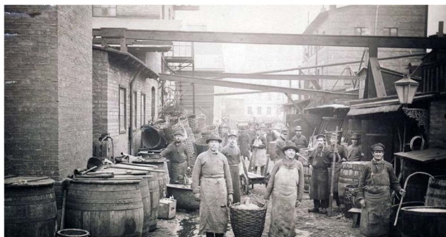
Fig. 10 Workers at the Chemische Fabrik Theodor Goldschmidt in Berlin. 96