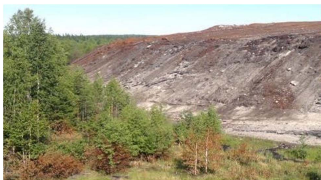
Fig. 14 Lignin Pile in the modern day Russia.

The 1-stage USSR modification of the Scholler process produced 45–46% sugar yield from “oven dry wood”, which corresponded with 60–70% of the original polysaccharide content in sawdust. After the percolation hydrolysis, the residual lignin still contained 15–25% residual cellulose. The annual production of lignin reached 1.5 M tons by the end of 1980s, but only 30% of this lignin was used in further applications. Whereas the rest formed giant landfills around the hydrolysis plants (Fig. 14), with the inherent risk of self-ignition. Part of the sulfuric acid could not be recovered and the sugar hydrolysate contained about 2% of glucose, 3% of other hexoses, 1% of pentoses, 0.4% mixed oligosaccharides and up to 0.6% of sugar decomposition products, including furfural, HMF and levulinic acid. 145 Pseudo-lignin compounds were also obtained in the hydrolysate, most likely from the condensation of sugars, furfural and phenolic compounds present in the lignin, turning the sugar solutions dark. Among minor contaminants, methanol, formaldehyde and soluble phenolics were also reported. 145