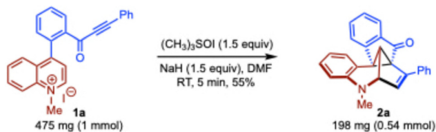
Scheme 5 Scaled-up reaction of 1a .