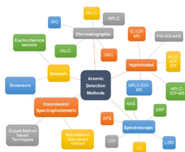
Fig. 3 Different methods of arsenic detection and determination.

The purpose of this review is to provide an overview of the analytical techniques (chromatographic, spectroscopic, colorimetric, biological, electroanalytical and coupled techniques) for arsenic determination in drinking water and the authors have mostly covered the literature over the past decade (2010 onwards). Some older publications are referenced to support the key concepts and wherever necessary. A brief introduction to various analytical techniques followed by an evaluation of their capabilities and performance for arsenic determination are discussed. Associated challenges as well as potential avenues for future research, including the demand for rapid analysis and on-site technologies for remote water analysis and environmental applications are discussed. We hope that this review