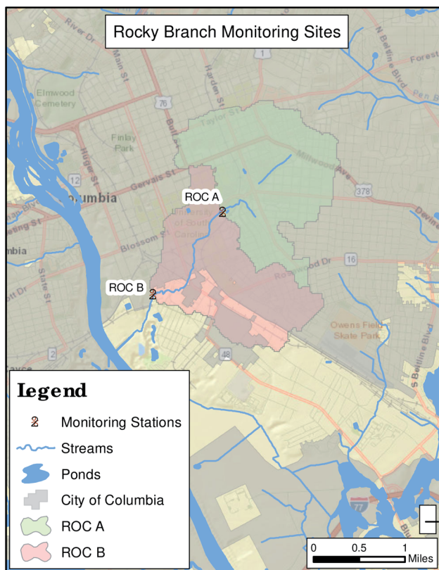
Fig. 2 Map of Monitoring Stations in Rocky Branch Watershed.

The SMIA station is adjacent to the Parkside Drive bridge near the entrance to Earlewood and NOMA Bark Park. This park is also home to Earlewood Community center where members of the City often hold meetings. The high pedestrian traffic at this location makes it ideal for the monitoring site to educate the public on stormwater quality. The station includes a multi-parameter sonde, pressure transducer, staff gauge, solar panel, rain gauge, autosampler for CANARY and remote telemetry equipment. The station is docked on the stream bank where there is constant and substantial flow over the sonde. Flow data at this site is provided by a USGS station just downstream of the monitoring station, located near North Main Street by the railroad trestle.