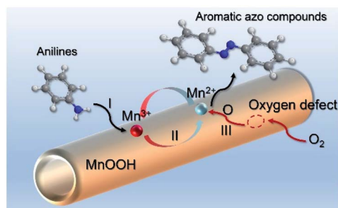
Scheme 1 The proposed catalytic process for oxidative coupling of anilines using NT-MnOOH.

Fig. 4c and d exhibit the selectivity of 1,2-diphenyldiazene as functions of the surface Mn 3+ level (|ΔAOS|) and surface oxygen defect abundance (O 2- /OH - ratios). Both high levels of surface Mn 3+ species and the large amount of surface oxygen defects facilitated the improvement of the selectivity of 1,2-diphenyldiazene. The NT-MnOOH-12 catalyst with the lowest surface Mn 3+ level and the smallest amount of surface oxygen defects exhibited the lowest selectivity towards 1,2-diphenyldiazene. Comparatively, other NT-MnOOH- t catalysts yielded at least 99.3% selectivity (Fig. 4c and d). Among them, the NT-MnOOH-8 catalyst with the optimized surface properties delivered the best chemoselectivity towards azo compounds.