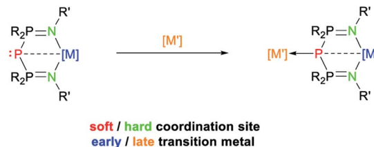
Scheme 4 Targeted early (left) and early/late (right) metal complexes of BIPP .

of a late transition metal to the central phosphorus atom). 32,34–37,65–68