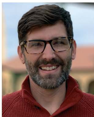
Eric A. Appel

Gels were formed at 2 wt% of HPMC-C x and 5 wt% of PSNP by mixing the two components followed by centrifugation to remove bubbles.