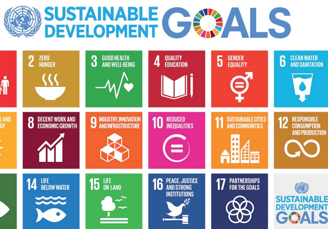
Fig. 1 The 17 SDGs of the UN, aimed at ending poverty, protecting the planet, and ensuring prosperity for all as part of the sustainable development agenda. Each goal has specific targets to be achieved over the period 2015–2030 ( http://www.un.org/sustainabledevelopment/sustainable-development-goals/ ). An 18 th SDG aimed at clean air should be added.

It is proposed here to adopt an additional SDG on “clean air”, at the same level as good health, clean water, sustainable industrialization and cities, responsible production, climate action, marine and terrestrial life (SDGs 3, 6, 9, 11, 12, 13, 14, 15, respectively), not only because ambient air pollution is the leading environmental risk factor of the global burden of disease, 8 but also because many other SDGs cannot be achieved without considering air quality. The next Section 2 focusses on results from the Faraday Discussion meeting Atmospheric chemistry in the Anthropocene , held in York, UK, from 22–24 May 2017, which presented scientific results that underpin this statement. Section 3 presents an update of the