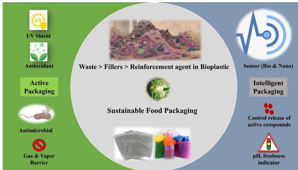
Fig. 2 Improved characteristics of waste-derived fillers incorporated bioplastic [the image is created by the 1st author Zeba Tabassum; information is obtained from ref. 18 and 19].

livestock and crop production. This increase has, in turn, contributed to the substantial generation of agricultural waste. Over the last century, regions such as China, India, and Africa have not only witnessed rapid population and economic growth but also a significant increase in agricultural waste production. Each year, India generates a large amount of solid waste, with agricultural waste being the most significant, ranging from approximately 350 to 990 million tonnes per year. 23