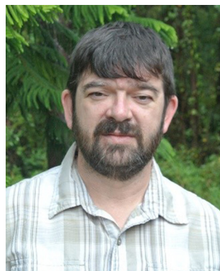
Vladimir N. Uversky

The prevalence of intrinsically disordered regions (IDRs) in proteomes of both prokaryotes and eukaryotes is well-documented, with estimates suggesting that a significant fraction of the human proteome contains disordered segments. 12 IDRs confer functional advantages, allowing proteins to engage in multiple interactions and respond dynamically to environmental cues. 11,12 Transcription factors, for instance, frequently contain disordered effector domains (EDs) that enable