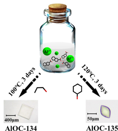
Fig. 1 “Ligand-induced aggregation and solvent regulation” synthesis of AIOC-134 and AIOC-135 .

Single-crystal X-ray diffraction (SCXRD) showed the compound AIOC-134 crystallizing in the monoclinic space group C2/c with a total diameter of 3.1 nm, a height of about 1.9 nm, and a central hole of 0.5 nm (Fig. 2a and c). The entire molecular ring includes 16 \text{Al}^{3+} ions, 24 2-NA ligands, 16 ^i\text{OPr} , and eight bridged hydroxyl connections (Fig. 2a). Each aluminum ion