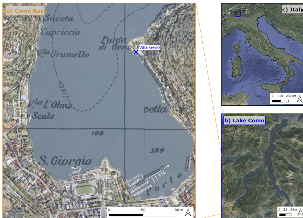
Fig. 1 Location map of Como Bay (panel a), as part of Lake Como (panel b), and Italy (panel c). The sampling site of environmental samples (Villa Geno) is highlighted with a blue cross.

with stainless-steel blades, and sieved to <2 mm. This treatment yielded enough homogeneous samples in the form of fragments with the size scale of MPs (<5 mm), needed for the following analytical steps. In total, 3 samples of PE, 3 of polypropylene (PP) and 3 of polyethylene terephthalate (PET) were prepared for metal analysis. For every polymer category, one pristine and two environmental samples were analysed (Table 1).