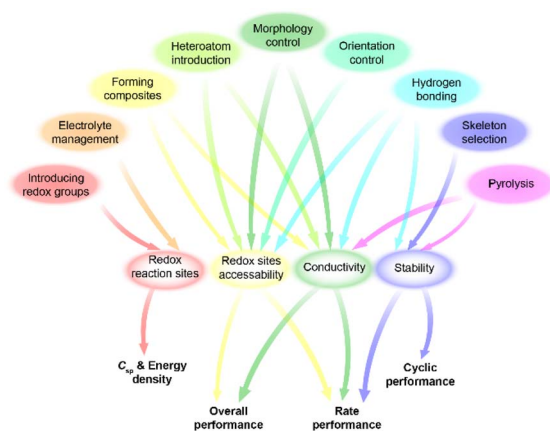
Scheme 2 Relationship between strategies and device performance.

provide improved stability. The high temperature treatment of COFs generates heteroatom-doped carbon materials with a mixture of conjugated and nonconjugated backbone.