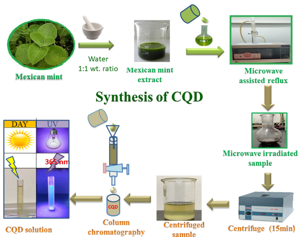
Fig. 4 Synthesis process of CQDs by microwave method reproduced with permission from ref. 29 Copyright © 2021 Elsevier.

For example, Kailasa et al. synthesized multicolour emissive carbon dots, namely B-, G-, and Y-CMCDs, from muskmelon by employing different oxidizing agents and tuning the reaction parameters. Fig. 5 represents the fabrication of multicolor-emissive CDs from muskmelon. The synthesized CQDs were tested on Cunninghamella elegans , Aspergillus flavus , and