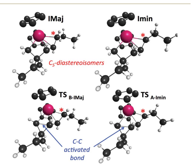
Fig. 4 Structures of Imin, IMaj and their associated transition states of formation.

Calculations indicate that direct isomerization between (Z)and (E)-2c, (i.e. between Imin to IMaj) is not allowed. This originates from the restricted rotation around C<sub>4</sub>-C<sub>5</sub> caused by either the presence of a \pi -bond or the constraint of the 6membered ring in the two σ-allyl complexes. Alternatively, a mechanism that connects Imin to I and thus to IMaj via allylic C-H activation and formation of a zirconium-hydride-diene complex has been computed; the highest transition state of this pathway is located at 22 kcal mol<sup>-1</sup> above energy reference.<sup>19</sup> Consequently, the most energetically preferred pathway from Imin to IMaj is via A, I and B with the highest transition state being 10 kcal mol<sup>-1</sup> above the energy reference. This isomerization between A, B, C and D via I controls the stereoselectivity of the reaction and highlights the importance of the reversibility of the allylic C-H bond activation and C-C bond cleavage by heating the reaction mixture at 55 °C for 3 h.