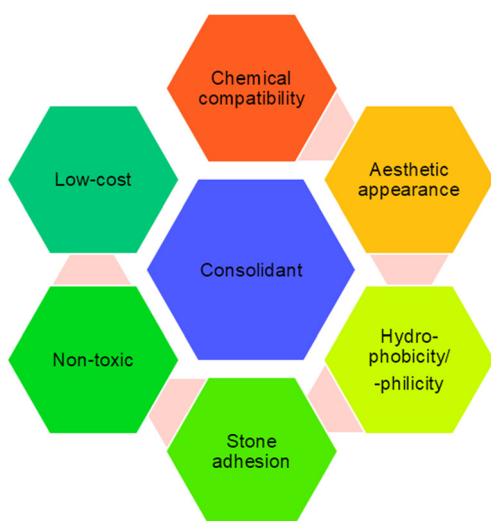
Fig. 1 Attributes that an ideal consolidant must possess.

Recent investigations have explored ammonium phosphate, particularly diammonium hydrogen phosphate (DAP), as an innovative consolidant for lime- and cement-based mortars. By reacting the calcium-rich substrate with aqueous solutions of ammonium phosphate, calcium phosphates (CaPs) can be formed inside the stone pores. These newly formed CaP minerals bond more effectively with aggregate particles, significantly enhancing the mechanical properties. The DAP treatment has shown high mechanical effectiveness on all substrates, thus resulting in the most effective consolidant on marble and limestone. Across all