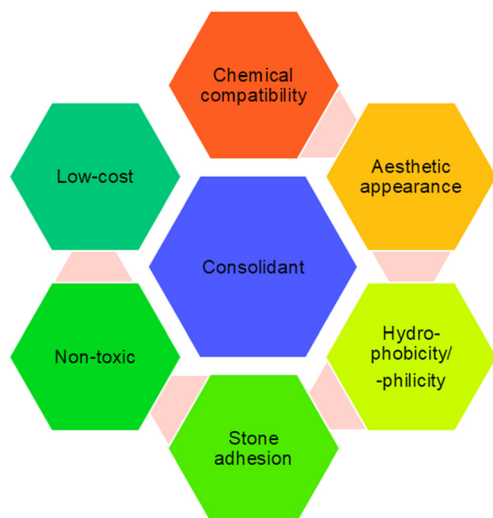
Fig. 1 Attributes that an ideal consolidant must possess.

Recent investigations have explored ammonium phosphate, particularly diammonium hydrogen phosphate (DAP), as an innovative consolidant for lime- and cement-based mortars. By reacting the calcium-rich substrate with aqueous solutions of ammonium phosphate, calcium phosphates (CaPs) can be formed inside the stone pores. These newly formed CaP minerals bond more effectively with aggregate particles, significantly enhancing the mechanical properties. The DAP treatment has shown high mechanical effectiveness on all substrates, thus resulting in the most effective consolidant on marble and limestone. Across all