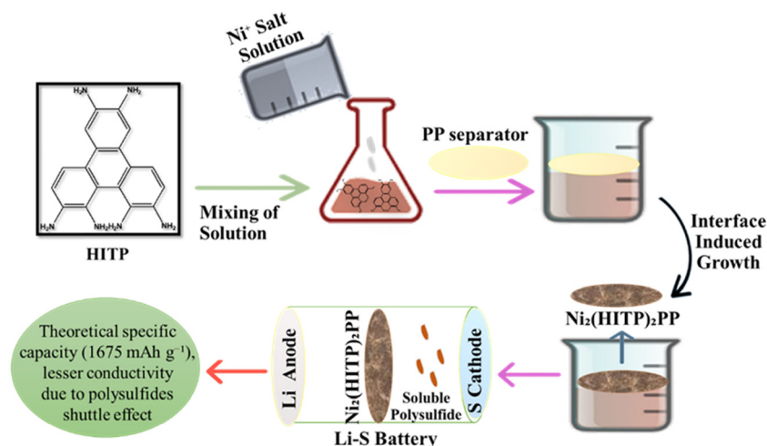
Fig. 6 The application of MOFs in lithium sulfur batteries. 116

Because of their greater energy density, lithium-ion batteries (LABs) with an oxygen cathode and lithium metal anode show